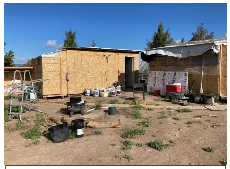
Unpermitted buildings – living quarters for growers

Huge unpermitted "greenhouses" made of poly plastic sheeting (AKA poly-tunnels) are being erected on private property. People who choose to use the temporary greenhouse