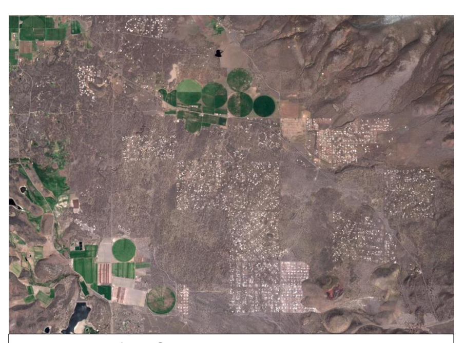
2021 view of Mt. Shasta Vista – approximately 2,500 to 3,000 grow sites represented by white dots

remote subdivision with limited infrastructure which was difficult to access, and largely unpopulated. It was a sandy region of juniper trees with lava filled gullies and ridges.