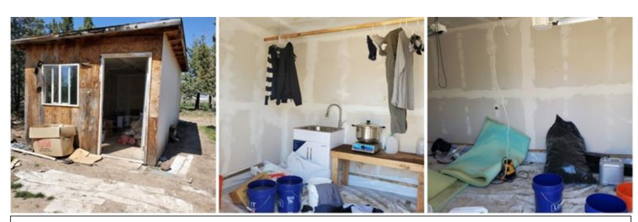
Unpermitted buildings used as living quarters for cannabis growers

Associations (HOAs) try to track who is camping legally or illegally within their subdivision. Camping is not the primary issue. Uncontained litter and garbage, dumping of raw sewage, numerous broken-down vehicles, and, at times, cultivation of cannabis are environmental hazards. Those camping on private properties refuse to move when asked to do so by some HOAs. Multiple County agencies have been known to issue or extend 30 day permits several times, unaware of the HOA's prior efforts to evict campers from the private property.