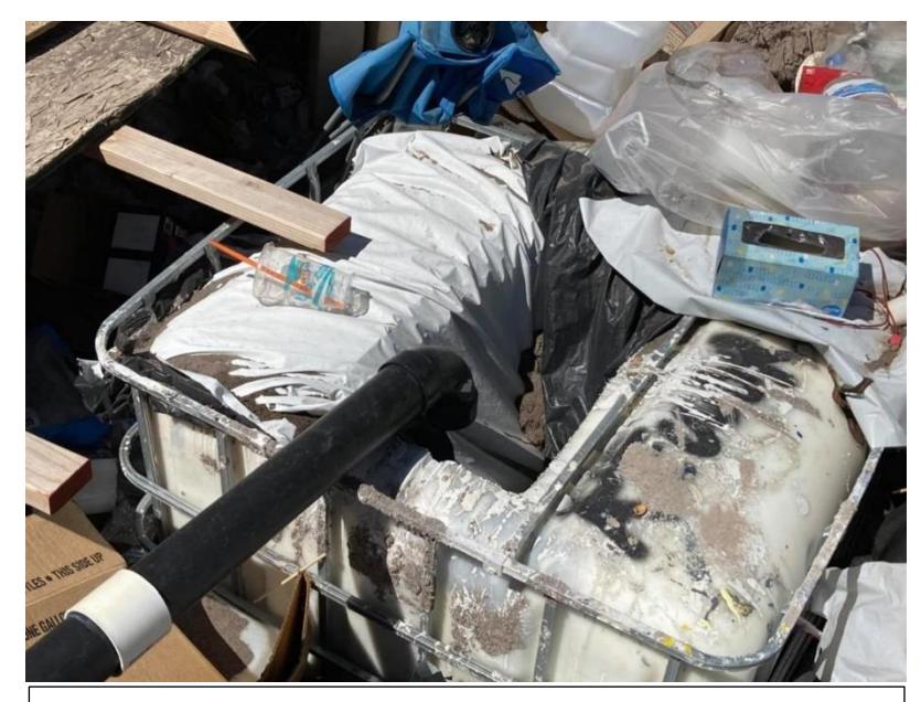
250-gallon caged water container used as an illegal sewage septic system.

Currently in Siskiyou County, it is unlawful to camp on private property for more than 30 days annually, without first obtaining a county permit. There is a rash of illegal activity associated with camping on private property. some cases, property living outside the owners County are unaware that there are people camping on their property. Homeowner