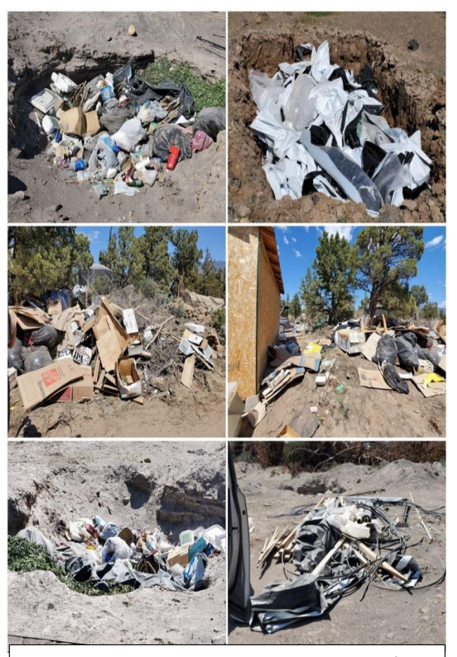
Unknown substances & garbage left behind or buried in ground in Mt. Shasta Vista

to emergency responders. There is often an uninhabitable living situation for growers living on the properties. Propane heaters are used by the residents, which are not designed for indoor use, creating both a fire hazard and a carbon monoxide danger. The use of generators for electricity can also increase the carbon monoxide danger. There have already been some carbon monoxide deaths associated with cannabis cultivation.