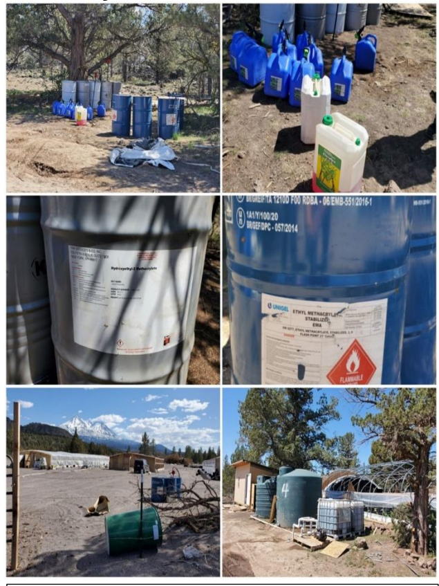
Improper storage and labeling of unknown chemicals and/or red diesel

The use of hazardous chemicals for deterring animals, and the use of fertilizers and pesticides is widespread, penetrating the soil, and eventually seeping into ground water. At this time, no agency is monitoring the numerous chemicals found at cannabis grow sites. Many of these chemicals are known cancer-causing substances. The Grand Jury learned that many of the 55-gallon drums found on grow sites, still labelled with their original chemical content, are being used to store red diesel. Red diesel fuel is an untaxed fuel. This fuel is used to operate generators, heaters, and water trucks. The unknown actual content of these drums possesses a significant risk