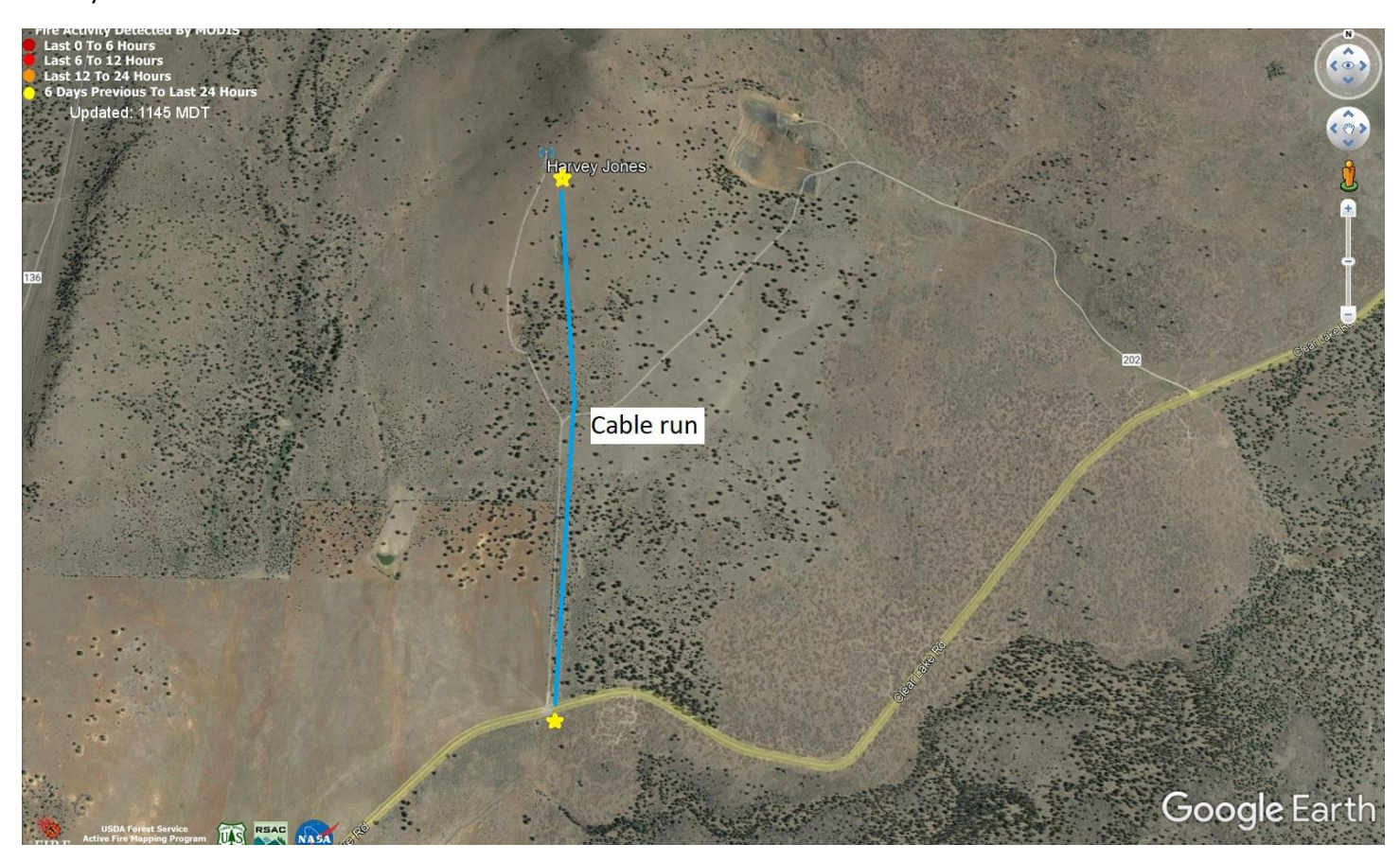
Aerial picture of cable run