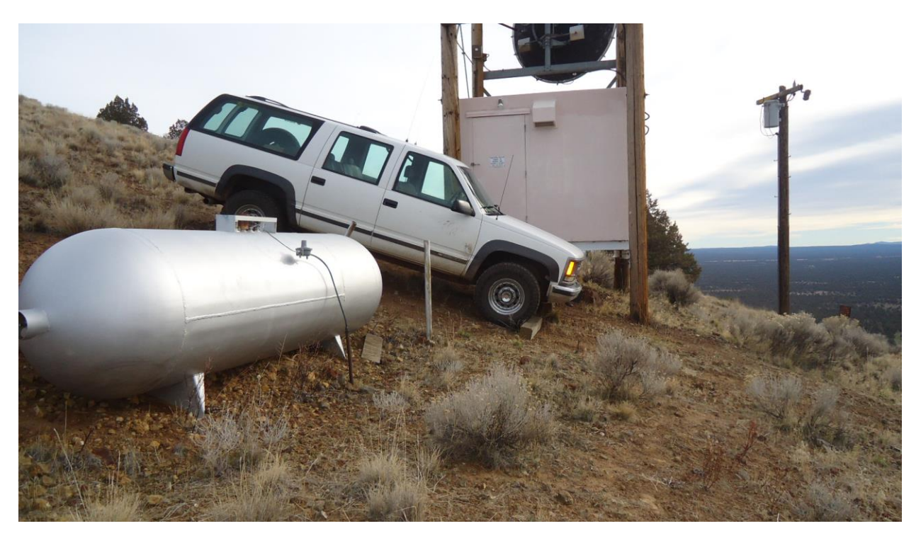
Harvey Jones Butte site (with power pole in background)