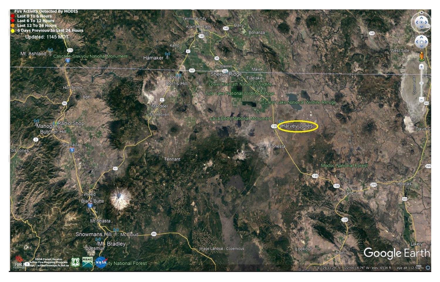
Harvey Jones Butte Location