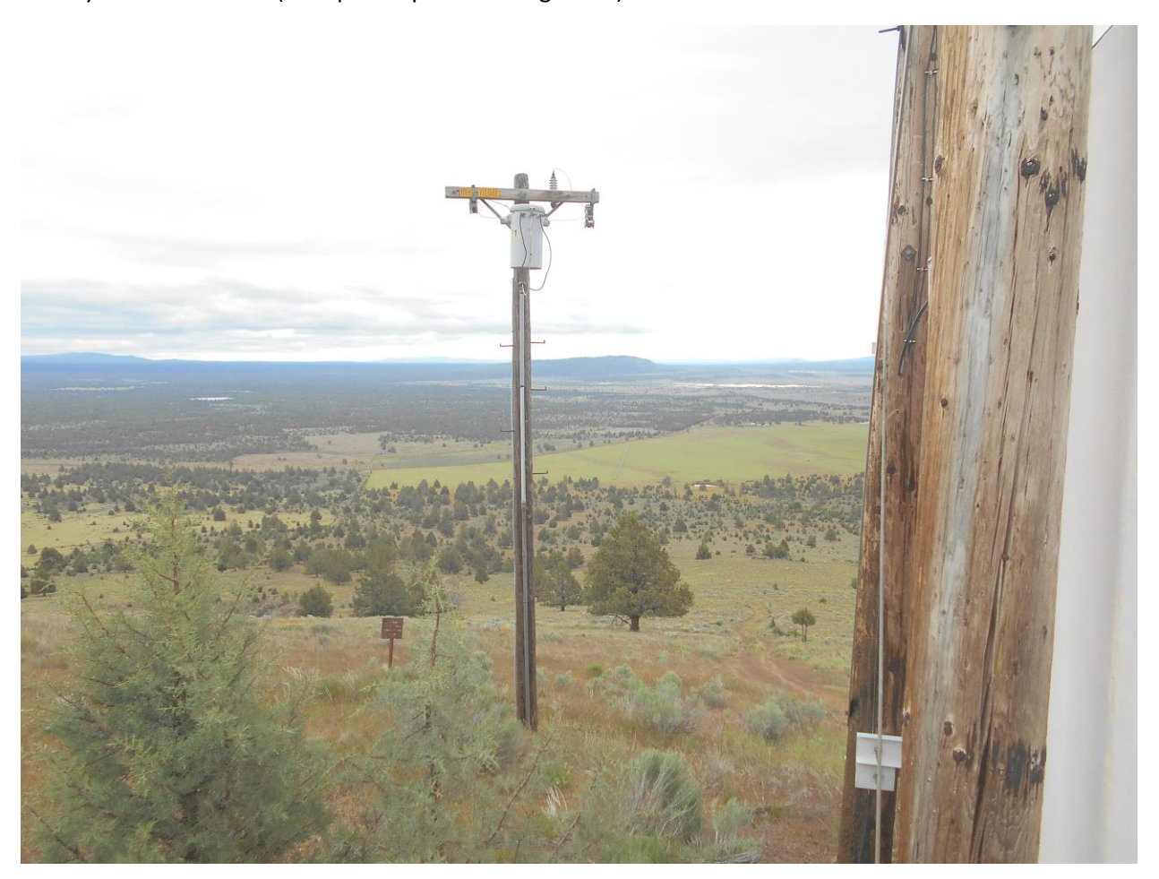
Step down transformer located on power pole