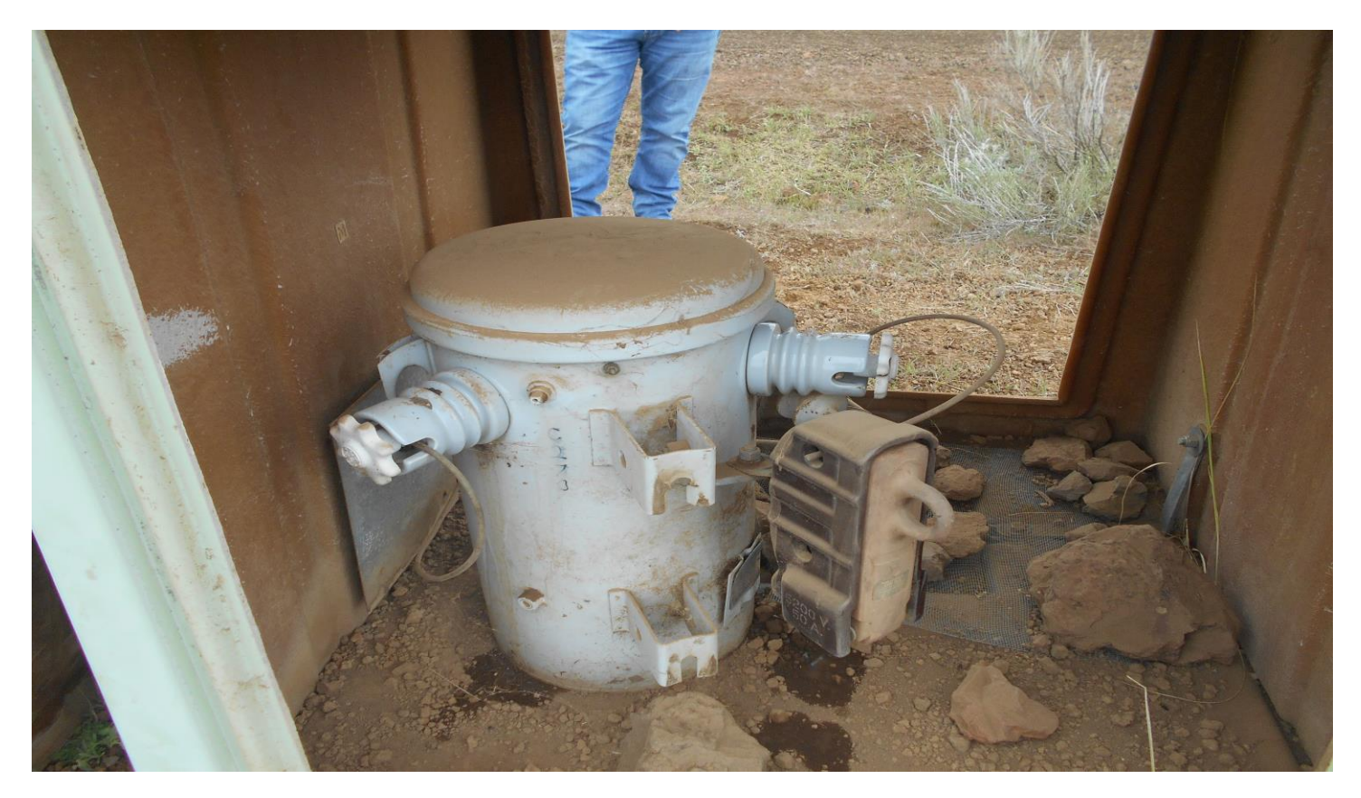
Step up 2.4K V side