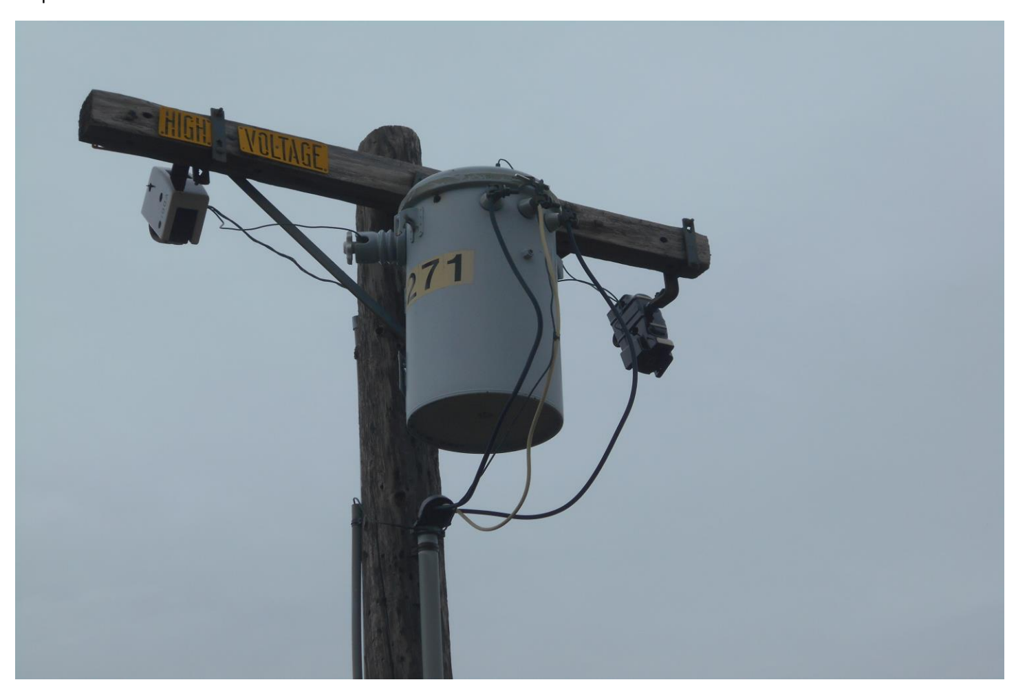
Step down 240V side