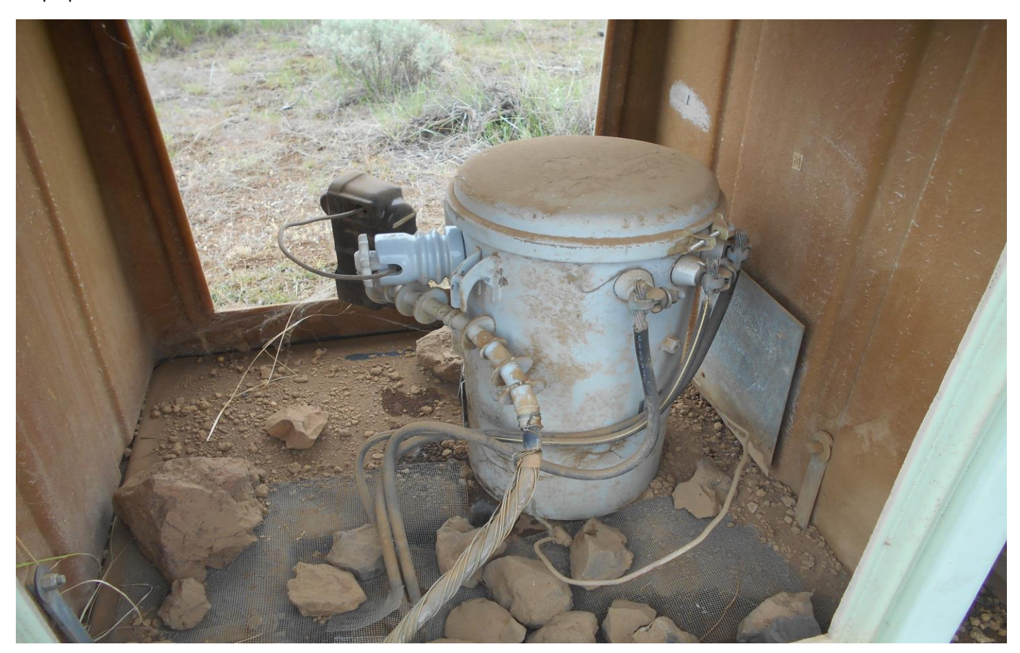
Step up 240V Side