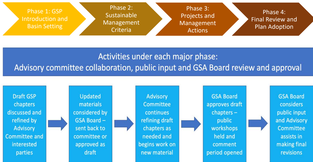
Figure 2: Iterative Process of GSP Development

A schedule has been developed which will guide the iterative process of developing and presenting draft sections of the GSP, and then securing input from committee members, the GSA Board and the public. The primary sections of the GSP—the basin setting, sustainable management criteria, and projects and management actions—will be developed and refined sequentially by phase. Following improvement of these sections through collaborative stakeholder engagement, the final sections, including the introduction to the GSP and view towards implementation, will be developed and shared for feedback. Finally, the full GSP will be assembled, then shared for final review by the committee, the GSA Board and the public. Primary activities and associated milestones by phase will include: