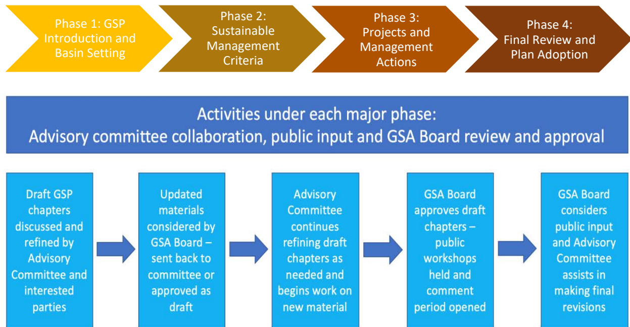
Figure 2: Iterative Process of GSP Development

A schedule has been developed which will guide the iterative process of developing and presenting draft sections of the GSP, and then securing input from committee members, the GSA Board and the public. The primary sections of the GSP—the basin setting, sustainable management criteria, and projects and management actions—will be developed and refined sequentially by phase. Following improvement of these sections through collaborative stakeholder engagement, the final sections, including the introduction to the GSP and view towards implementation, will be developed and shared for feedback. Finally, the full GSP will be assembled, then shared for final review by the committee, the GSA Board and the public. Primary activities and associated milestones by phase will include: