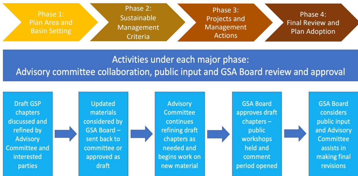
Figure 2: Iterative Process of GSP Development

A schedule has been developed which will guide the iterative process of developing and presenting draft sections of the GSP, and then securing input from committee members, the GSA Board and the public. The primary sections of the GSP—the basin setting, sustainable management criteria, and projects and management actions—will be developed and refined sequentially by phase. Following improvement of these sections through collaborative stakeholder engagement, the final sections, including the introduction to the GSP and view towards implementation, will be developed and shared for feedback. Finally, the full GSP will be assembled, then shared for final review by the committee, the GSA Board and the public.